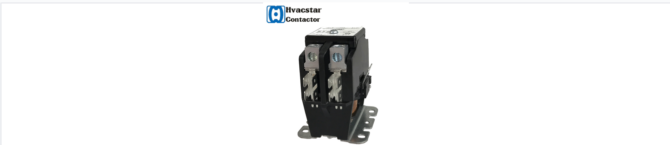
Standard 2-pole contactor for air conditioning systems.