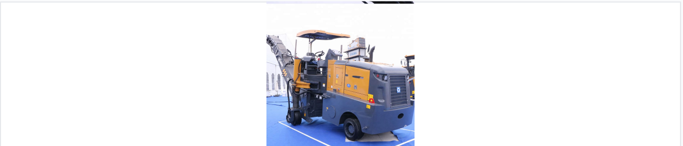
High-efficiency cold planer for road surface renovation.