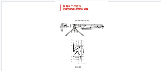
Detailed chart showing the 17-meter horizontal and vertical reach of the three-section boom.