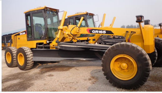
Heavy-duty frame and hydraulic system configuration.