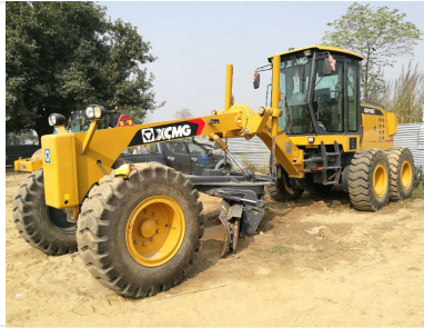
Ergonomic operator cabin designed for long-shift efficiency.