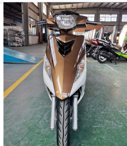
Front view featuring bright headlight and aerodynamic styling.