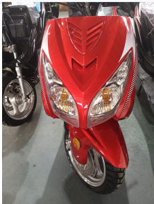
Equipped with LED hawk-eye headlights for enhanced visibility.