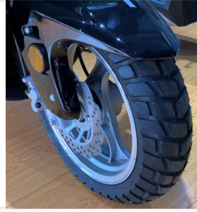
High-performance front disc brake and multi-spoke wheel design.