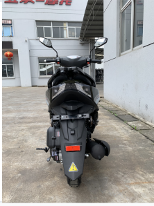
Robust frame construction with efficient exhaust system.