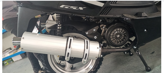
Oversized aluminum wheels provide stability and durability.