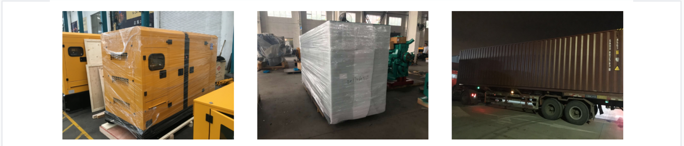
Fully enclosed and plastic-wrapped units secured on pallets for safe international shipping.