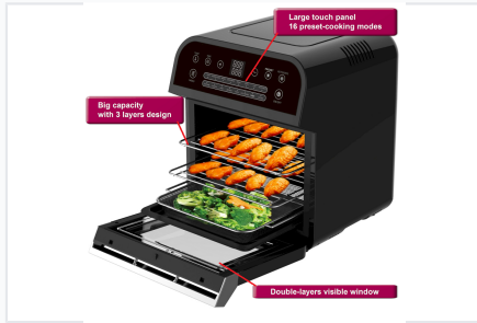
Digital control interface with 16 preset cooking modes