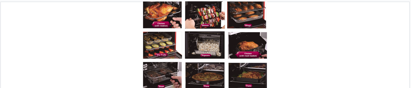
Versatile cooking capabilities from roasting chicken to dehydrating fruits.