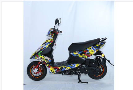
The scooter features a durable frame and graffiti-style decals for a unique aesthetic.