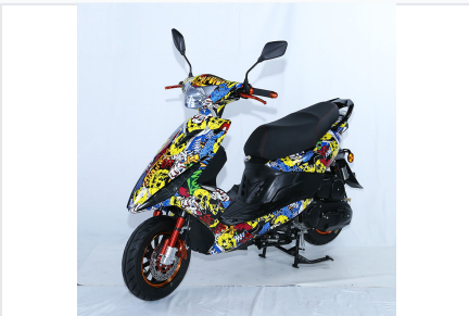
Stylish urban scooter with vibrant flame graphics and eye-catching design.