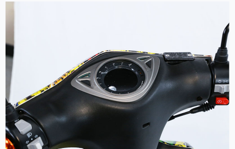
Ergonomic dashboard with clear instrumentation and accessible control switches.