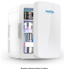
Fashion Design/ Fast Cooling

A sleek, modern design suitable for various professional and personal settings.