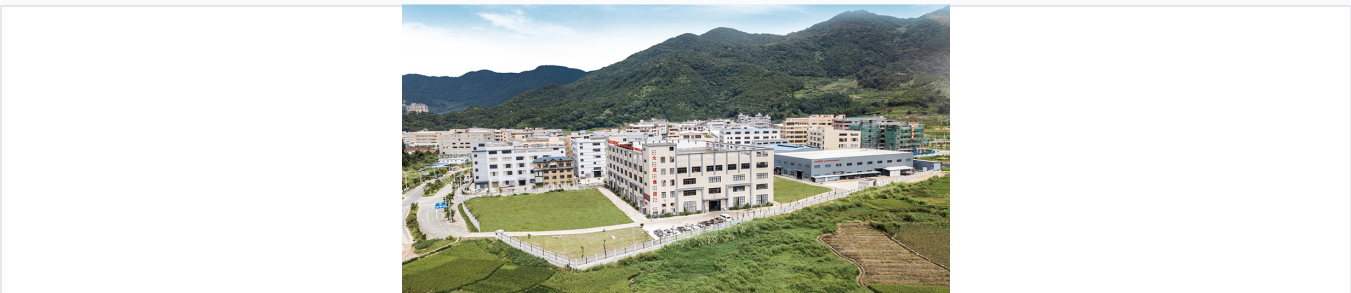
Compact and durable water pumping solution designed for efficient fluid transfer.