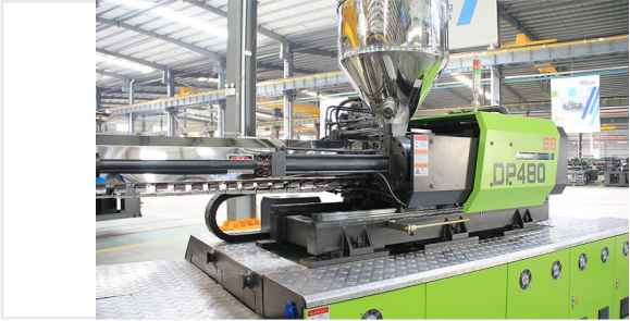
The two-platen design ensures uniform clamping force distribution and reduced flash.