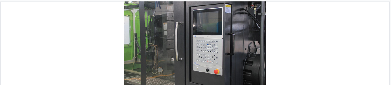
Advanced control system featuring a high-resolution display and comprehensive keypad for precise parameter input.