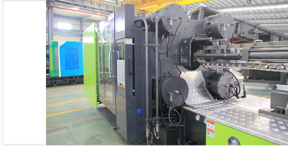
Robust clamping frame engineered for high tonnage and precise mold closing.