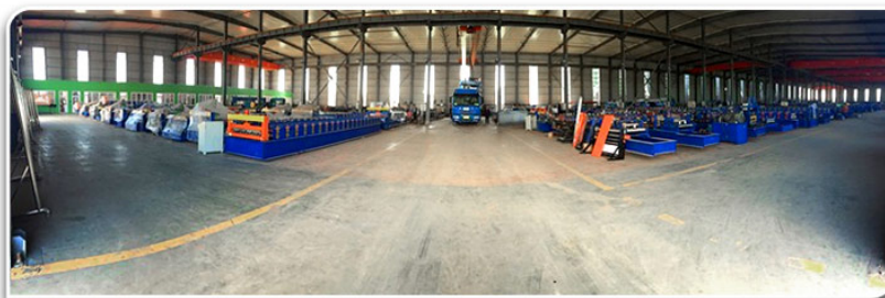
High-precision rollers shaping metal for lighting fixtures.