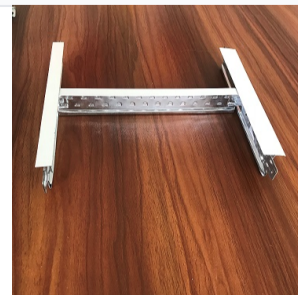
Detailed view of the perforated T-ceiling component used in suspended ceiling systems.