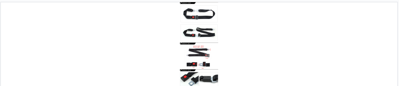
Dimensional overview of the 2-point static seat belt configuration