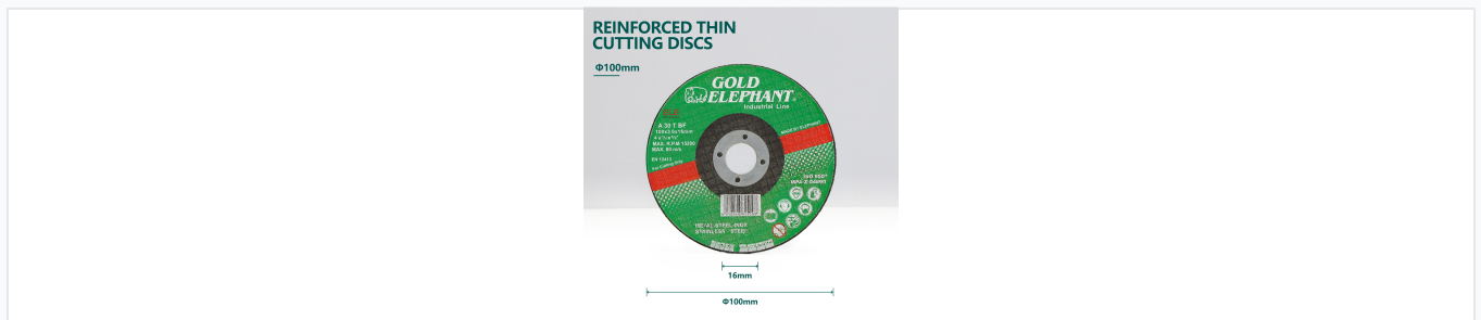
High-performance reinforced thin cutting disc compliant with EN 12413 standards.