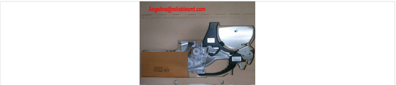
Precision-engineered smart feeder for 8x4mm component tape.