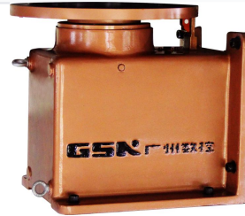
Single-axis Welding Table HBD250-1

Dual-axis welding table featuring a rotating table and tilting mechanism for optimal weld access.