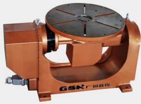
Dual-axis Welding Table HBS150-1

Dual-axis welding table featuring a rotating table and tilting mechanism for optimal weld access.