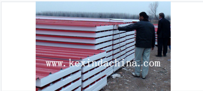
Finished sandwich panels featuring a durable red exterior and high-performance thermal insulation core.