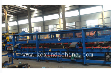
Designed for continuous operation and high production volume with integrated material handling.