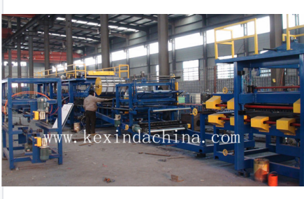
The robust steel frame and multiple forming stations ensure precise shaping of the metal sheets.