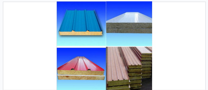
High-quality panels designed for superior structural integrity and weather resistance in commercial buildings.