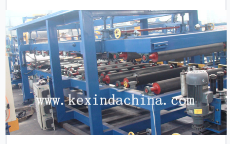
Multiple stands with precision rollers ensure accurate panel dimensions and consistent profiles.