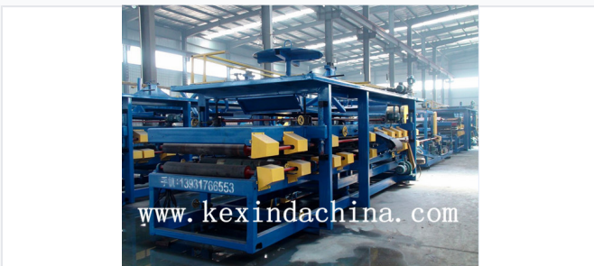
Complete production solution including decoilers, forming units, and automated cutting mechanisms.