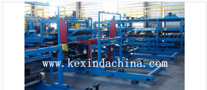
Robust construction capable of handling various metal types and thicknesses for industrial applications.