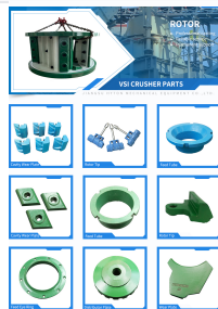
Range of essential spare parts for VSI crusher maintenance.