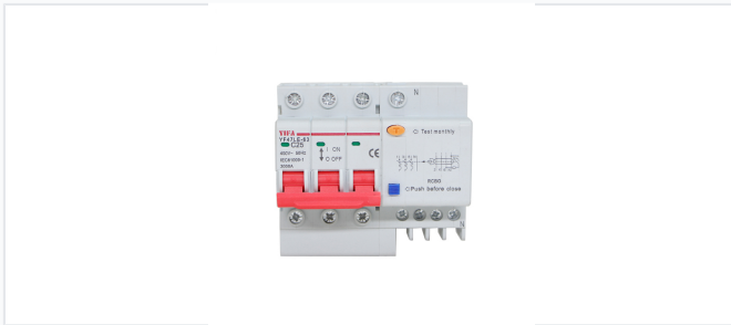
Detailed view of the interface including the monthly test button and ON/OFF indicator.