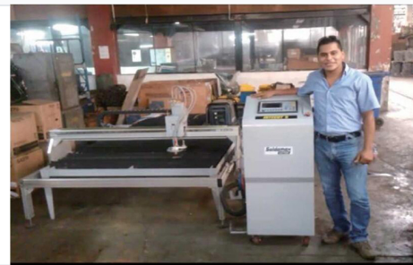
The portable design allows for easy mobility and setup directly at the job site.