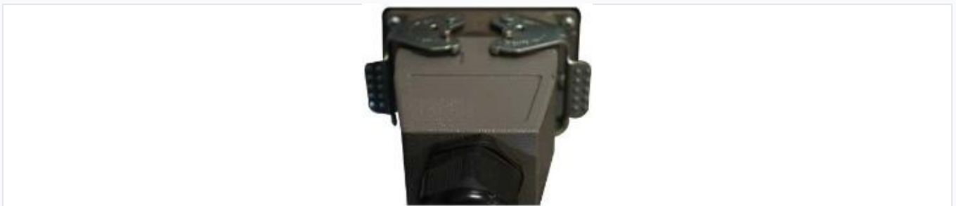
Durable, industrial-grade connectors ensure reliable power and signal transmission.