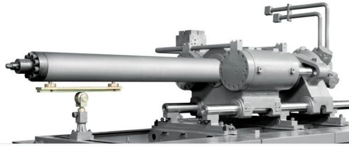
Dual-cylinder balanced injection system for stable, precise operation.