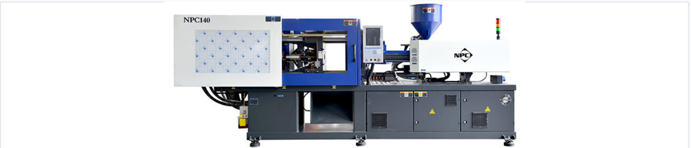
Overview of the high-performance NPC 140 molding machine.