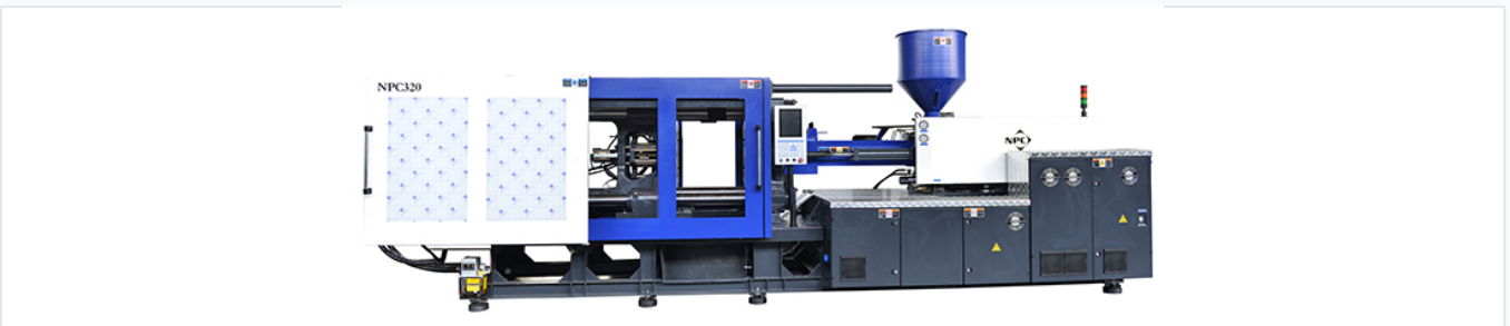
The NPC 320 injection molding machine, featuring a robust and stable design for industrial production.