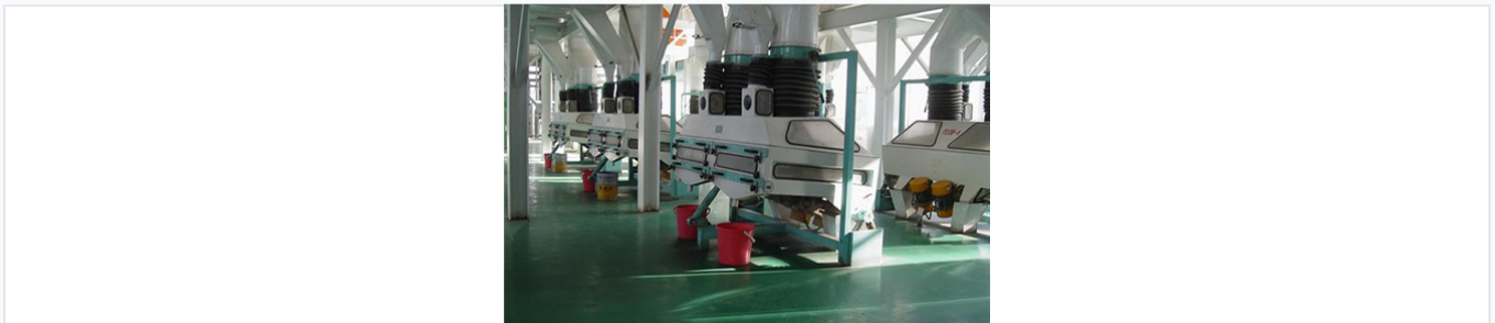
Primary cleaning and sorting stage equipment.