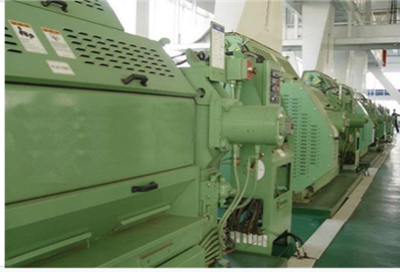
Flaking mill unit designed for uniform flake thickness.