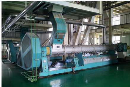
Extruder system for mechanical oil processing.