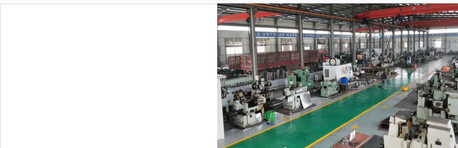
Robust construction designed for heavy-duty industrial conveyor systems.