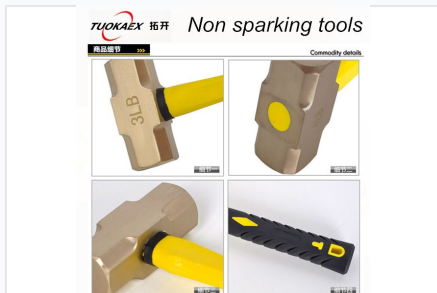
Precision-cast sledge hammer with a durable wooden handle for secure grip.