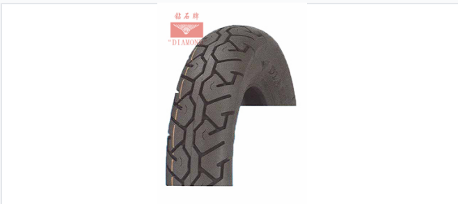
Engineered tread pattern for effective water displacement and enhanced traction.