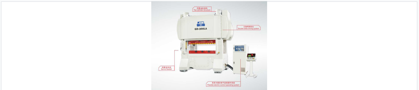
High-speed press featuring top cylinder structure and double-sided driving system.