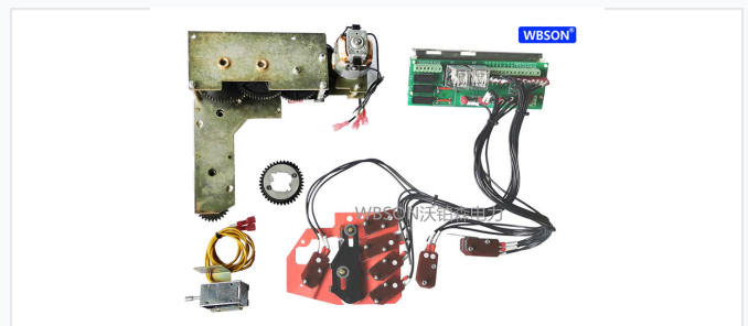
Close-up of the WBS040-Q geared motor assembly and control board configuration.