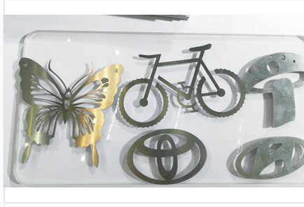
Complex patterns and shapes demonstrate the machine's high cutting capability.