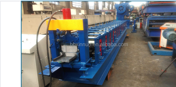
Manual operation provides control and flexibility in the forming process.