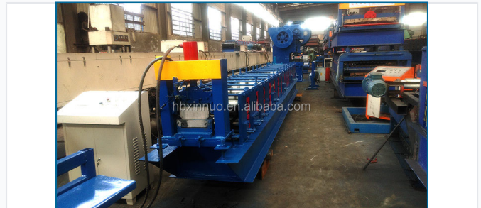
Versatile machine combining roof tile making, metal sheet shearing, and roll forming.