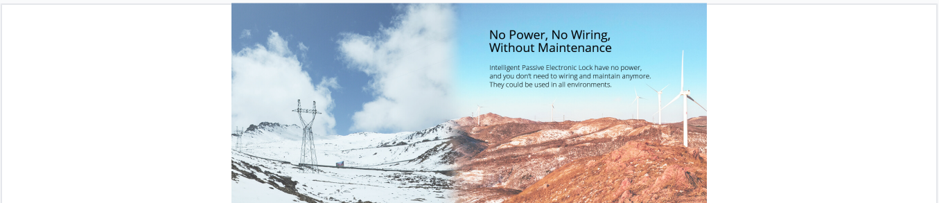
Maintenance-free design suitable for all environments.