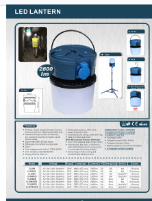
Detailed technical overview and mounting capabilities of the LED lantern.