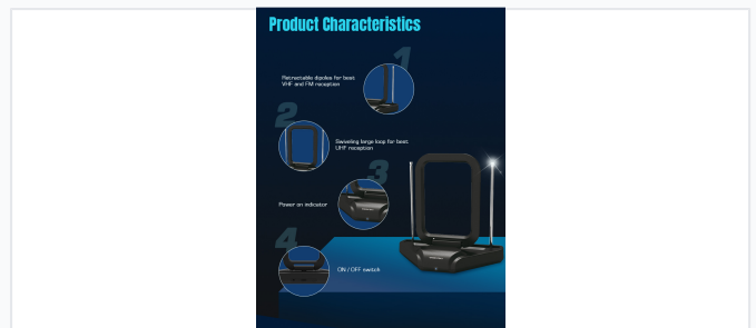
Equipped with retractable dipoles, a swiveling UHF loop, power indicator, and a dedicated ON/OFF switch.