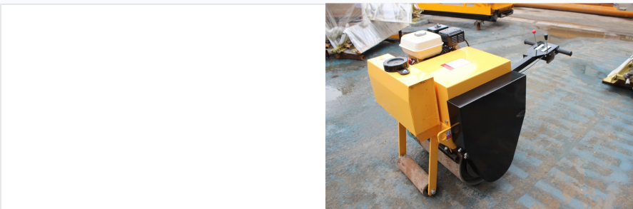
A versatile road roller designed for efficient soil and asphalt compaction.