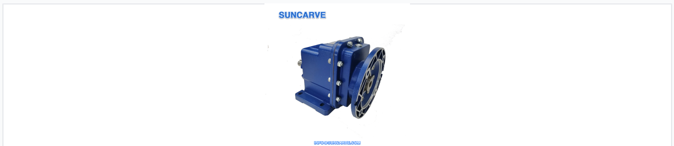
High-performance helical gearbox designed for efficient power transmission and long-lasting reliability in demanding environments.