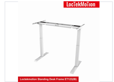
Loctekmotion Standing Desk Frame ET123(IB)

This 2-stage standing desk frame kit provides an ergonomic desk solution. It features easily accessible screws for leg adjustments, simplifying setup and maintenance.