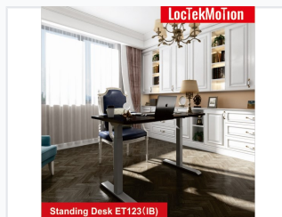
Standing Desk ET123(IB)