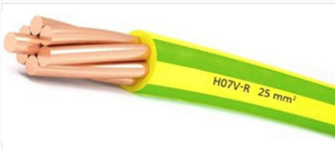
Cross-section view showing stranded copper conductor and PVC insulation.