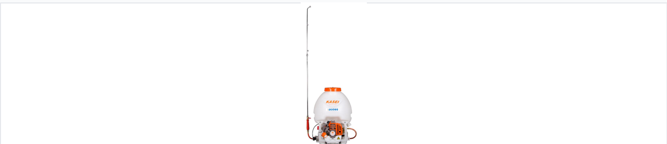
Backpack power sprayer featuring a large-capacity tank and ergonomic design for efficient agricultural spraying.