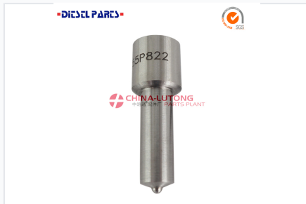
Precision-engineered nozzle designed for optimal atomization.