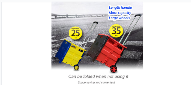
Available in multiple configurations with load capacities of 25kg and 35kg.