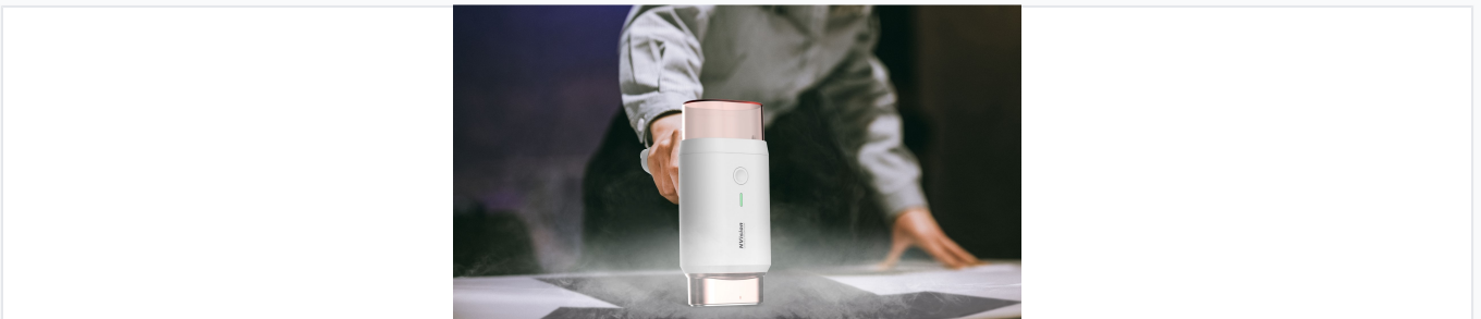
Ergonomic and lightweight design perfect for travel and home use.