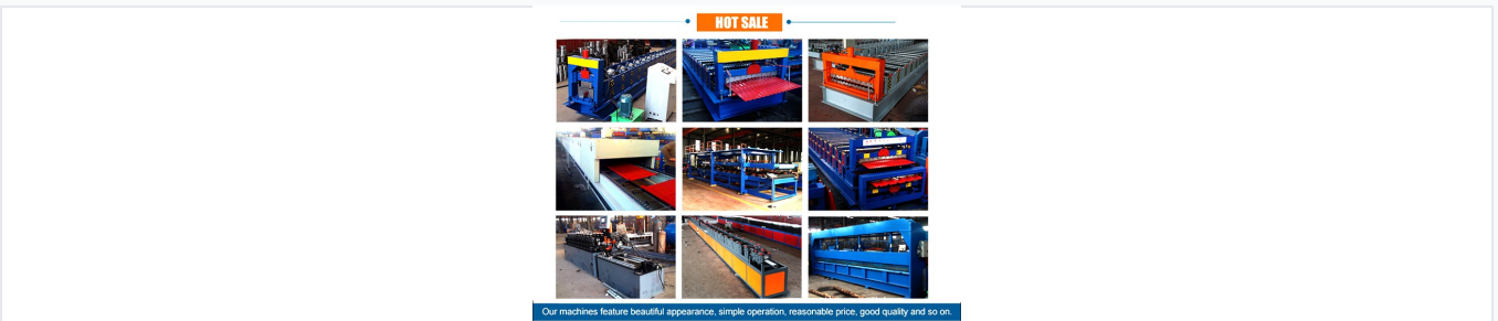
Our machines feature beautiful appearance, simple operation, reasonable price, good quality and so on.

Fully automated production line for high-performance sandwich panel manufacturing.