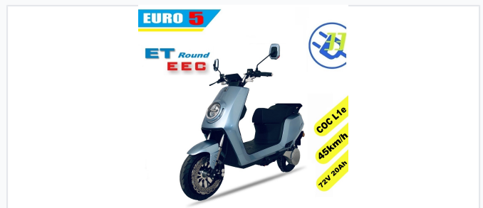
Distinctive round headlight design provides excellent visibility and a signature aesthetic.