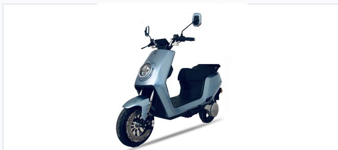
The ET Round features a modern, ergonomic design suitable for daily urban commuting.