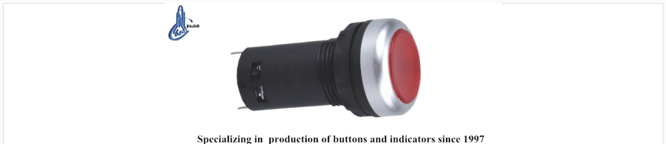
Specializing in production of buttons and indicators since 1997 High-durability electric indicator pushbutton for industrial control systems.