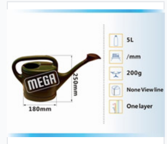
5L watering pot sample produced by the machine.