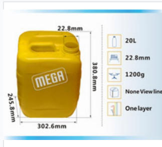
Example of a 20L industrial container produced with single-layer construction.