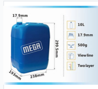
10L industrial container with two-layer construction and viewline.