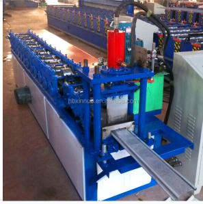
Robust blue steel frame housing multiple high-precision forming roller stations.