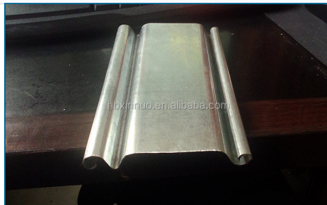
Adjustable roller settings ensure consistent forming across various metal thicknesses.