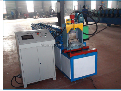
Integrated PLC control system for automated operation and precise parameter management.