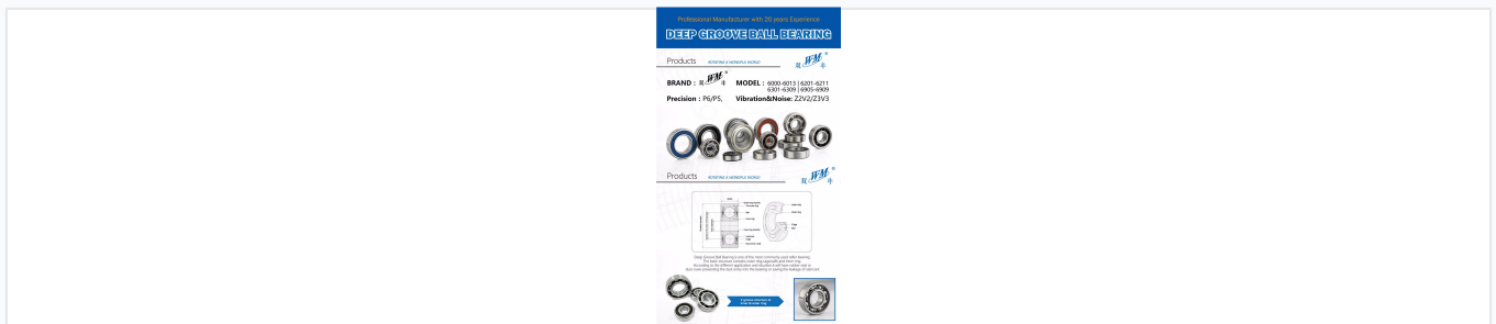
Internal structure of a deep groove ball bearing showing outer ring, cage, balls, and inner ring.